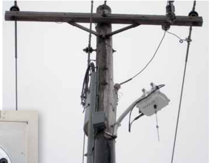
The router, pictured on the pole above, receives usage information from the new Gridstream meters (left).

complete that circuit. We will also complete a 1.5 mile three-phase circuit out of our Anson substation toward Jim Falls this year.