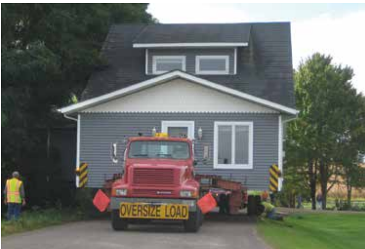
Below: The house at the driveway of its new location. CVEC linemen reattached the raised, de-energized lines with jib on bucket truck.