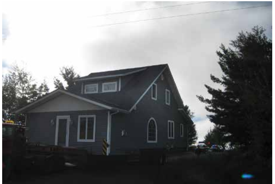
Opposite page: The house travels along County Highway O.