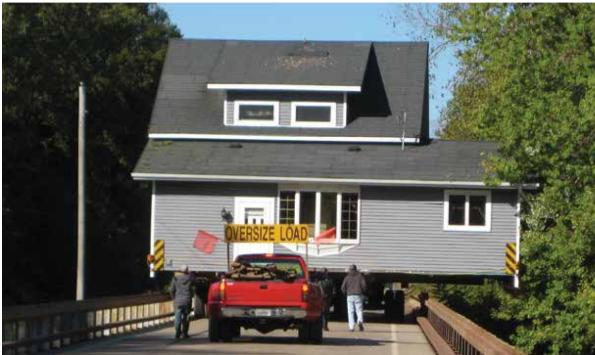
Left: The home needed to be loaded higher on the trailer to clear the bridge.