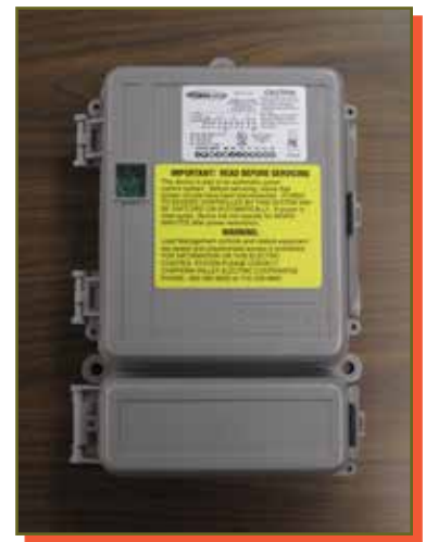
Load Management Receiver

If you have any questions regarding this test, please call the office.